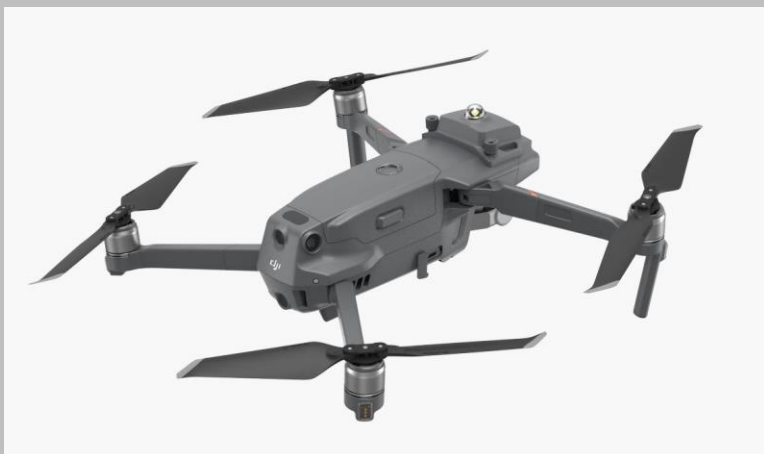
DJI Mavic Enterprise 2 Dual Unmanned Aircraft System

We still have much more to do to prepare for the introduction of Lehman Township's Unmanned Aircraft System (UAS) Program but are hopeful to be fully operational by the summer of 2021.